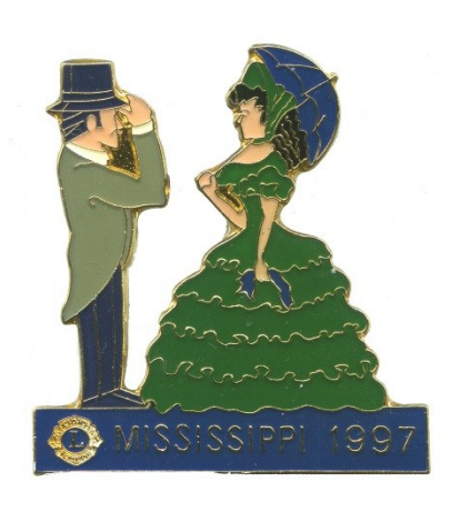
Incorrectly Dated 1997